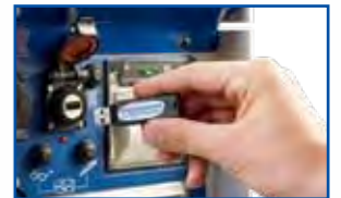
USB memory stick for saving, loading and archiving of welding programs and monitored welding data