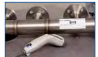
Compatible with standard peripheral equipment: printer, bar code reader, oxygen indicator etc.