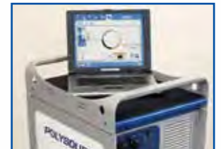
Offline & online programming with standard PC as well as optional touch screen

Built-in closed loop water cooling system with safety valve for welding head and torch