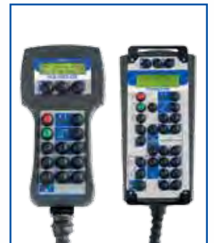
Full function remote control 4-axes or 6-axes with welding program selection